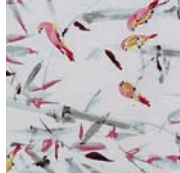
Linen Bamboo Path FABRIC in Rose, $49 per yard, Tonic Living, tonicliving.com.