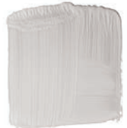
Cement Gray 2112-60 PAINT , Benjamin Moore, benjaminmoore.ca.

Fabrics and paints for recreating this home's pretty palette.